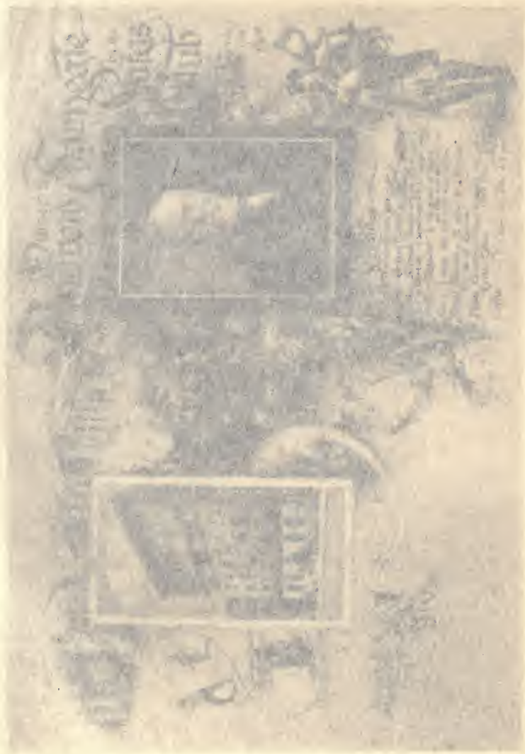
Menu of the dinner to Andrew Carnegie, 1909